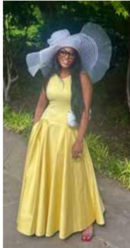
A Pretty Girl